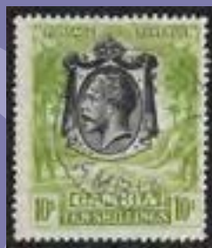
Lot 971 Est £40