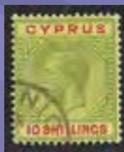
Lot 754 Est £360