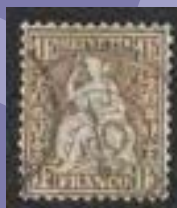
Lot 2029 Est £120