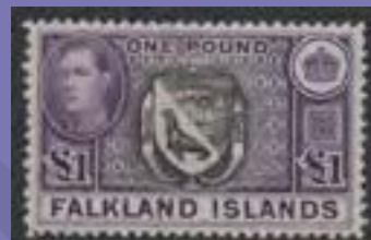
Lot ex 813 Est £160