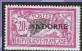
Lot 925 Est £75