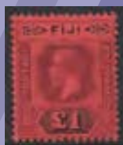
Lot ex 825 Est £120