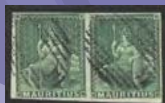
Lot 1488 Est £150