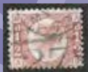
Lot 2259 Est £150