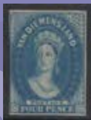
Lot 391 Est £600

Tel: 07938 601513 Email: info@avhstampauctions.co.uk