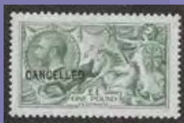
Lot 2390 h Est £1500