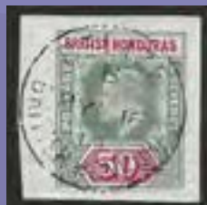
Lot 522 Est £36